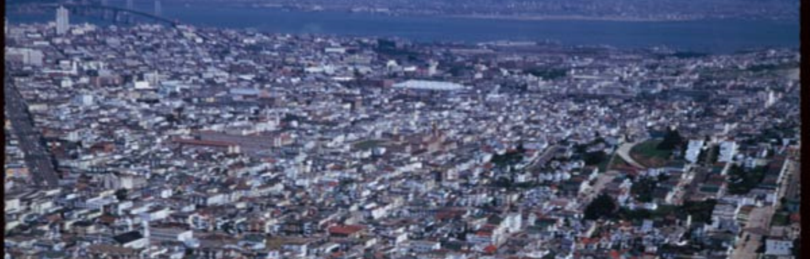
"The Mission from Twin Peaks."